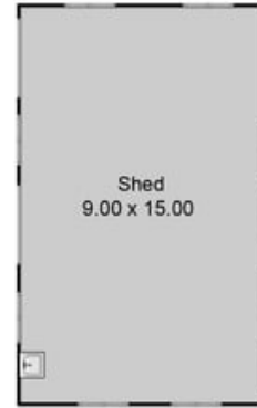
Shed not shown in actual position